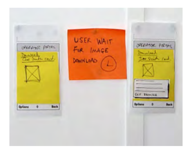
Figure 6 User wait times and feedback