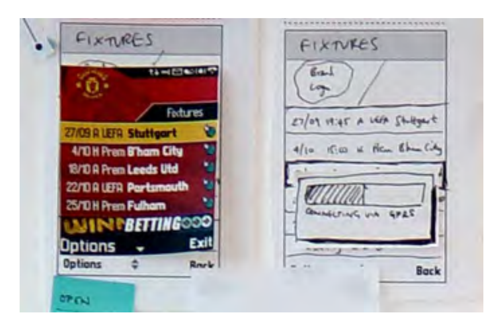
Figure 7 Visual design treatments