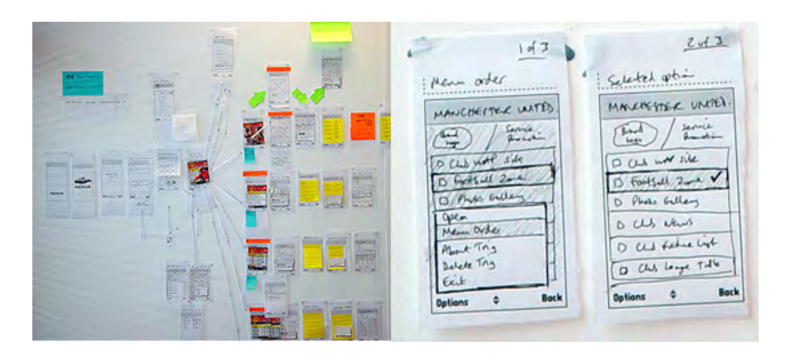
Figure 1 Micro and Macro views with paper prototyping

As we design, we switch between these two views constantly. A key benefit of the zooming is that it enables us to see that a service or application uses words, options, layouts and other elements consistently. Consistency is as important with mobile UI design as with any other user interface, so comparing the two views helps address this factor in a design.