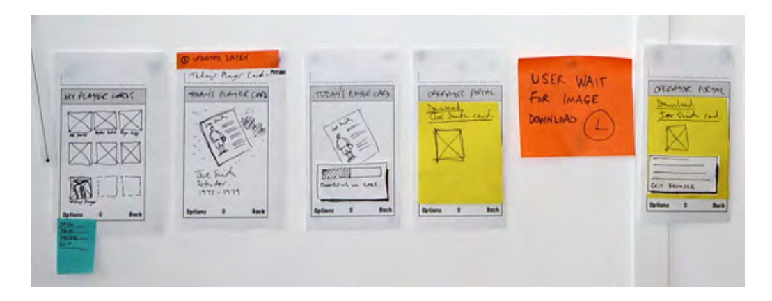
Figure 2 Screen by screen flows