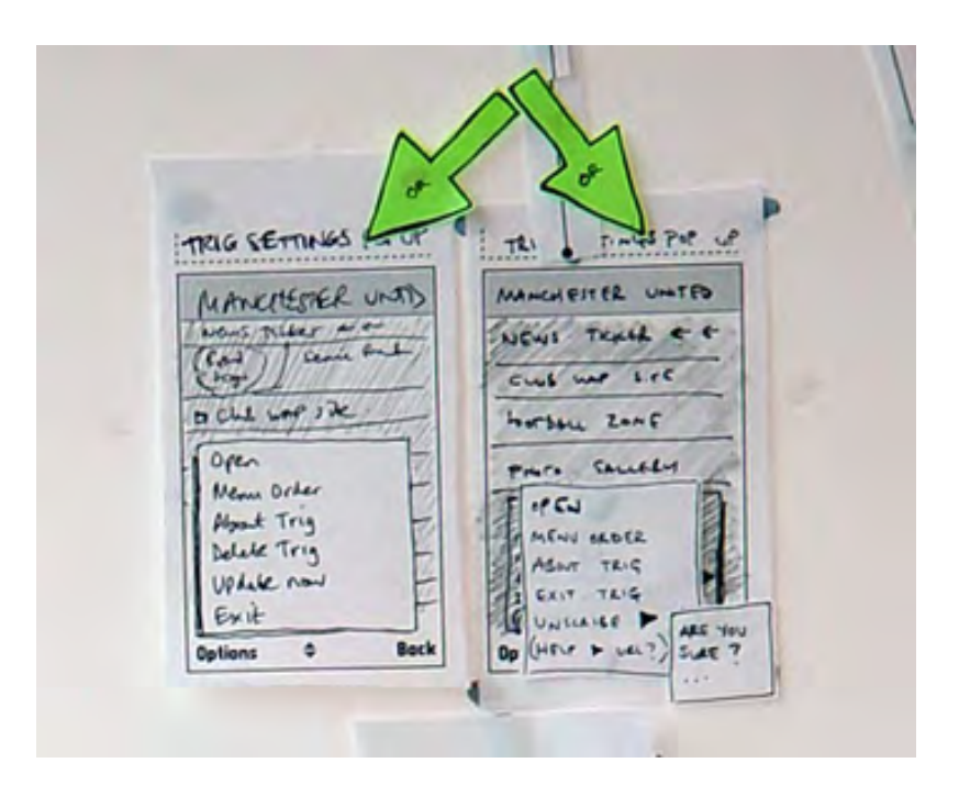
Figure 4 Design alternatives