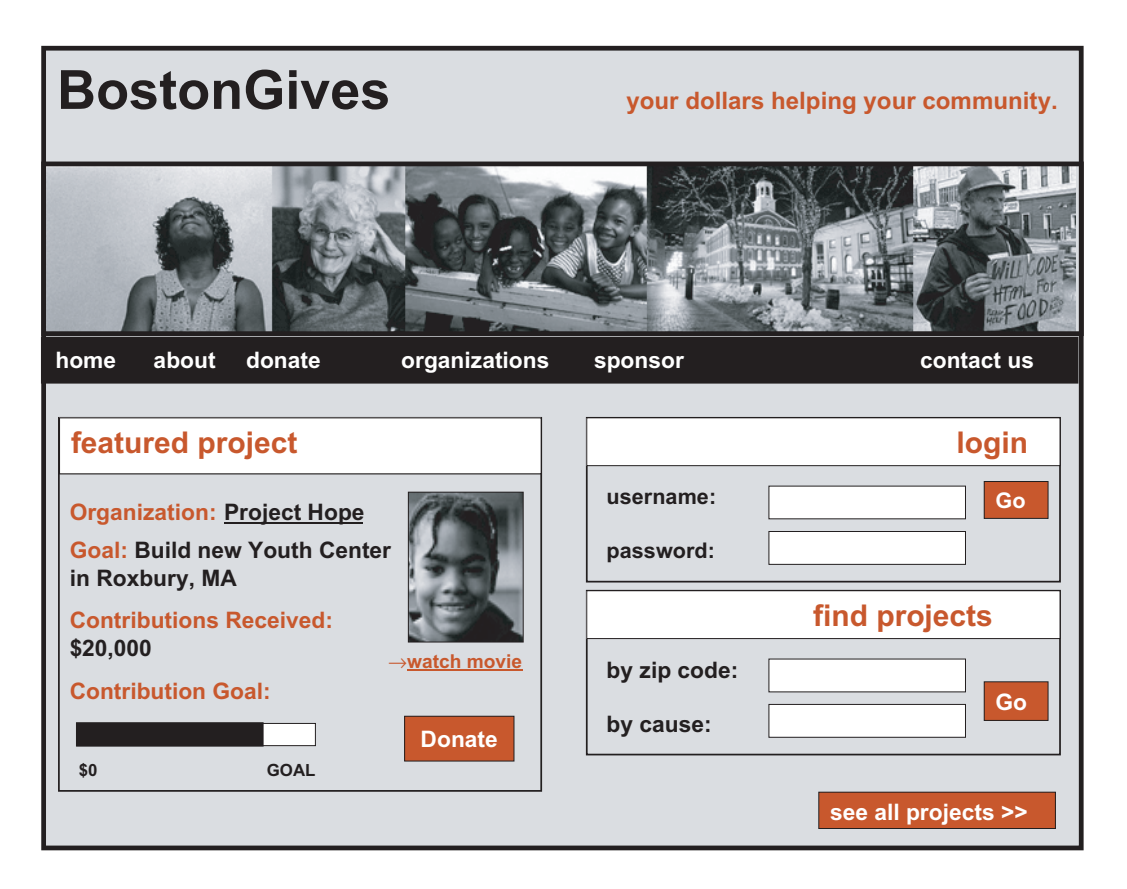
Figure 1 Prototype of "Boston Gives" home page